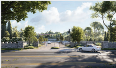
Current Proposed Entry View