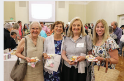
Senior Appreciation Sunday, 2025

Enhancements and updates are needed, especially in Hampton Hall and the Gathering Space. This includes purchasing a generator and performing infrastructure updates to ensure our fire suppression system is adequately protected against freezing.