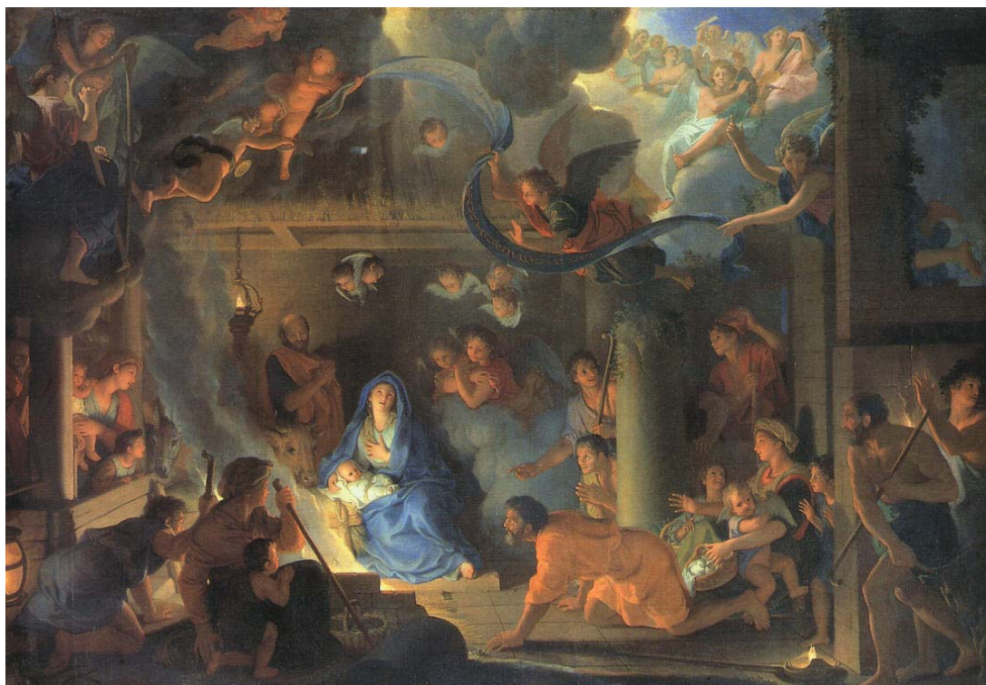
Adoration of the Shepherds

THE NATIVITY OF OUR LORD THE HOLY EUCHARIST